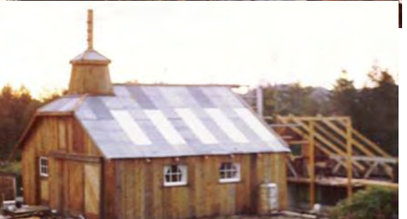
Solar Water Heater